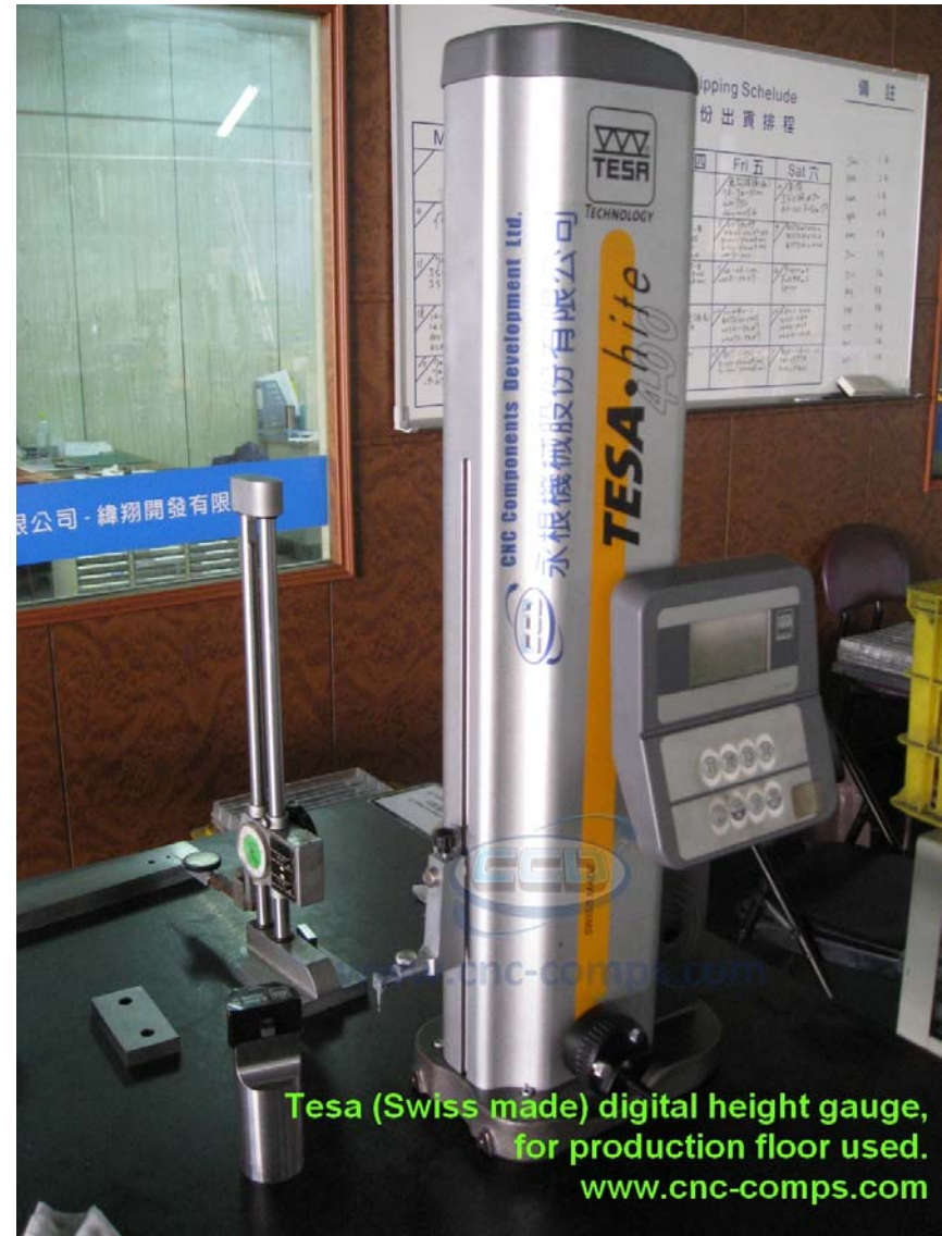
Tesa (Swiss made) digital height gauge, for production floor used. www.cnc-comps.com